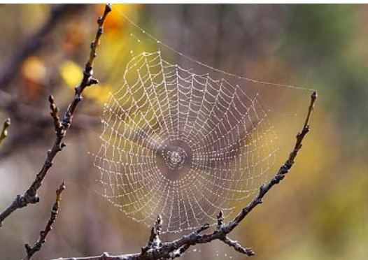
A spider's web, an extremely reliable structure comprised of multiple elements.

must not collapse when subjected to the peak design load or stress for which it was designed. A structure is deemed to satisfy the ULS criteria if all factored bending, shear and tensile or compressive stresses are below the factored resistance calculated for the section under consideration.