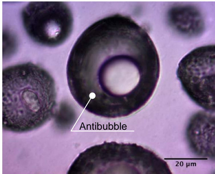
Figure 2: Optical microscopy image of antibubble with single core.

different from gas bubbles because of an incompressible droplet core in the centre of the bubble. Nevertheless, the first mathematical model for an acoustically active antibubble is derived during the work on this thesis. This Rayleigh-Plesset-like equation enables us to study differences in oscillator behaviour compared to gas bubbles, both with and without an encapsulating shell [15].