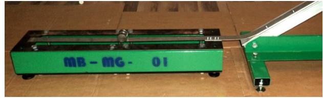
Figure 2: Front view of the experimental stand

The structural response to the moving mass is measured in four points across the beam by strain gauges, see Fig. 3. A half-bridge is used and the gauges are installed on the top and bottom surface of the beam. Additionally, two optoelectronics sensors are installed in order to record the speed of the traveling mass.