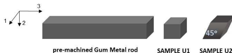
Figure 1: Configuration and orientation of the samples cut out from a Gum Metal rod for ultrasonic test.

Elastic constants and Young's moduli of the Gum Metal were determined using a non-destructive approach based on measurements of ultrasonic wave propagation. For the measurements of ultrasonic velocities in the sample the pulse-echo contact technique was used [2]. In order to determine all five independent elements of the elastic constants matrix for transversally isotropic solid at least five different values of velocities of ultrasonic waves propagating in different directions and/or with different polarizations must be measured in the material. For this purpose, two samples, denoted as U1 and U2, were cut out from the pre-machined Gum Metal rod in the way shown in Fig. 1. Sample U2 was cut out from the rod at an angle of 45^\circ to the axis 3.